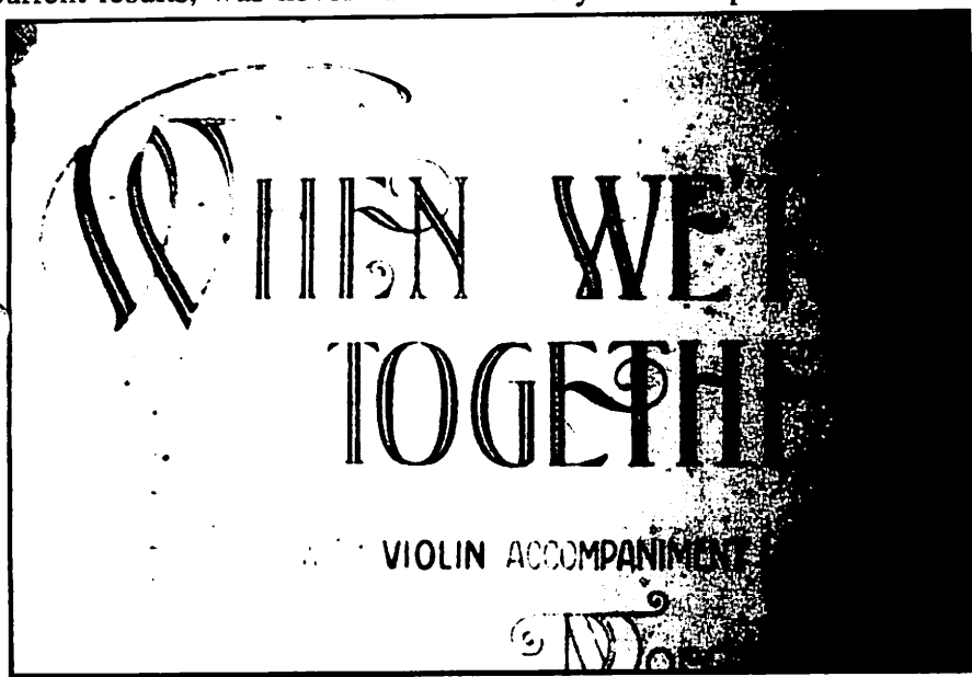
This photograph of the title page from a piece of sheet music was chosen by the Scole spirit team to convey the joy we all feel during our sittings.

then asked to dispense with the cameras, and take only the films (still sealed in their containers) into the sessions. The spirit technicians soon mastered this difficult approach, thereafter producing for us many more pictures and images. This technique does of course help to make the results even more evidential.